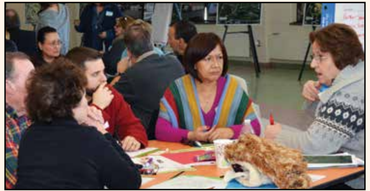
Envision Workshop participants engaged in discussion

In addition, library services would need to be suspended on the main floor during this process. This abatement