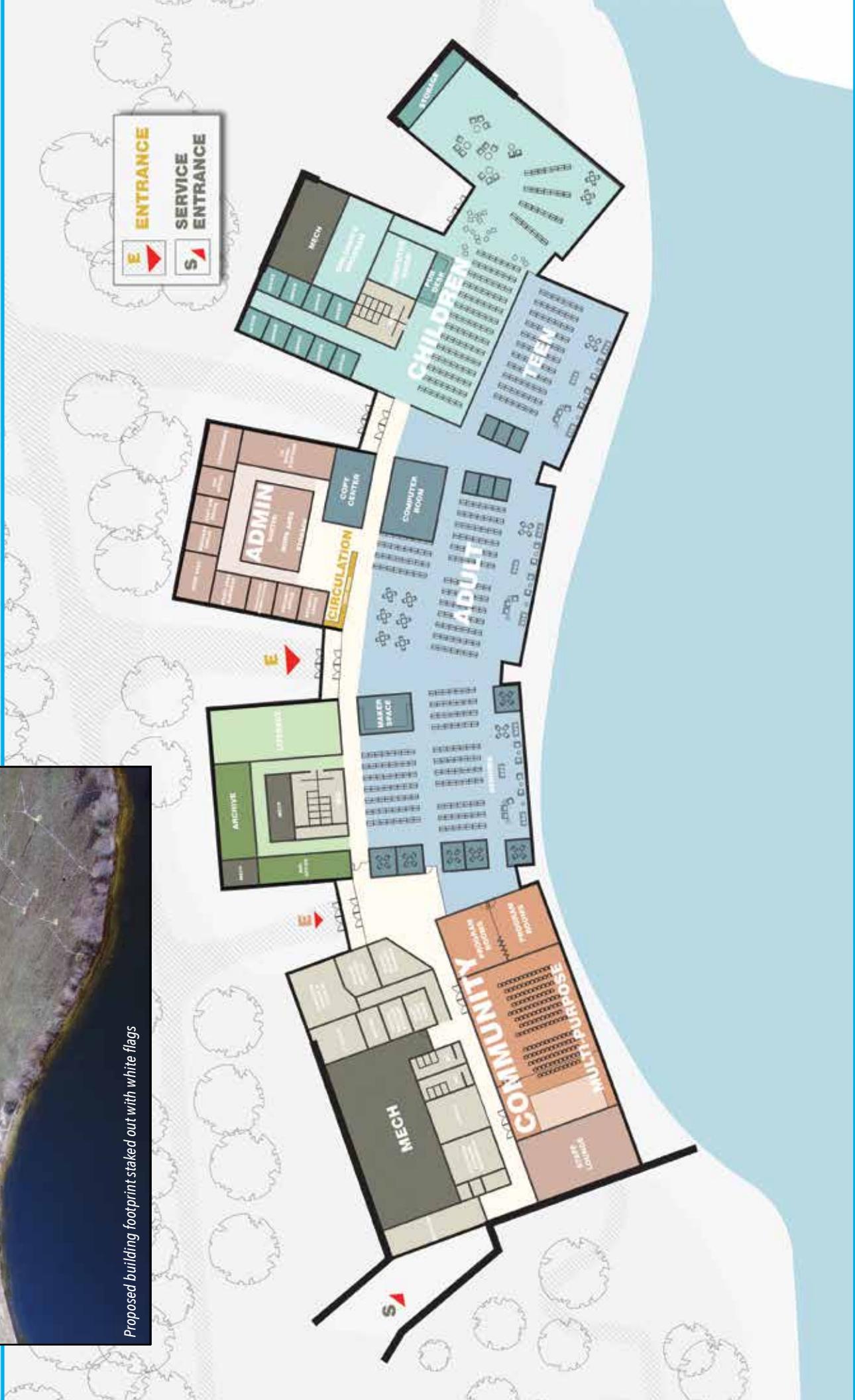
Proposed building floorplan