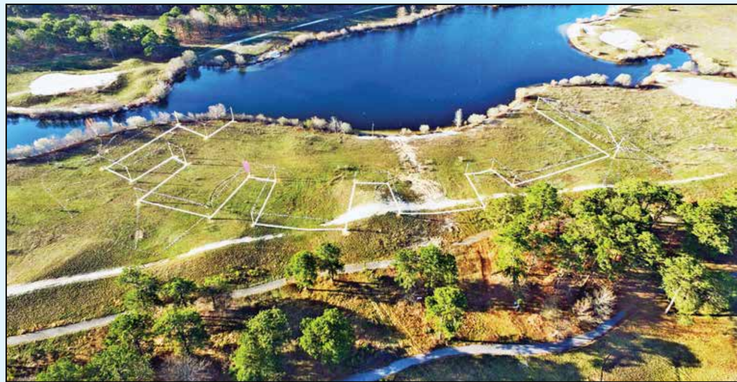
White flags mark the footprint of the proposed library building in this aerial view of the Shirley Links site