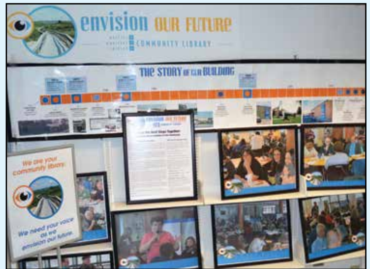
Project updates and a library timeline are displayed on the library's main floor

You will gain a library that is large and safe enough to meet the needs of our community's 56,000 residents; expansive meeting room space to meet all of our extensive programming; adequate and safe parking; ample, clean and ADA-compliant restrooms; the opportunity to sit quietly and enjoy a book, newspaper, magazine or personal device; additional computers and state-of-the-art technology to access online information for education, recreation and personal growth, and much more. In addition, your new library will be set in a location that will truly reflect the history, community values, connection to nature, aspirations and pride of this community.