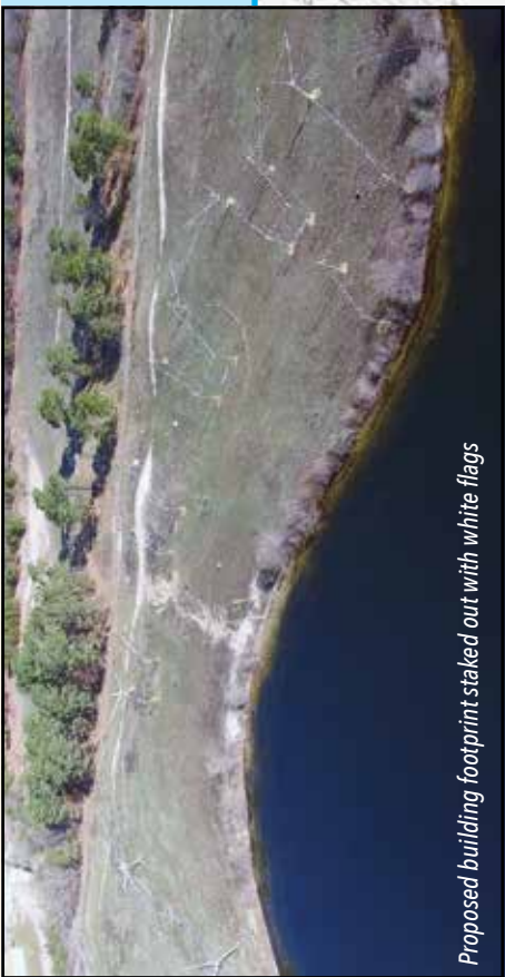
Proposed building footprint staked out with white flags