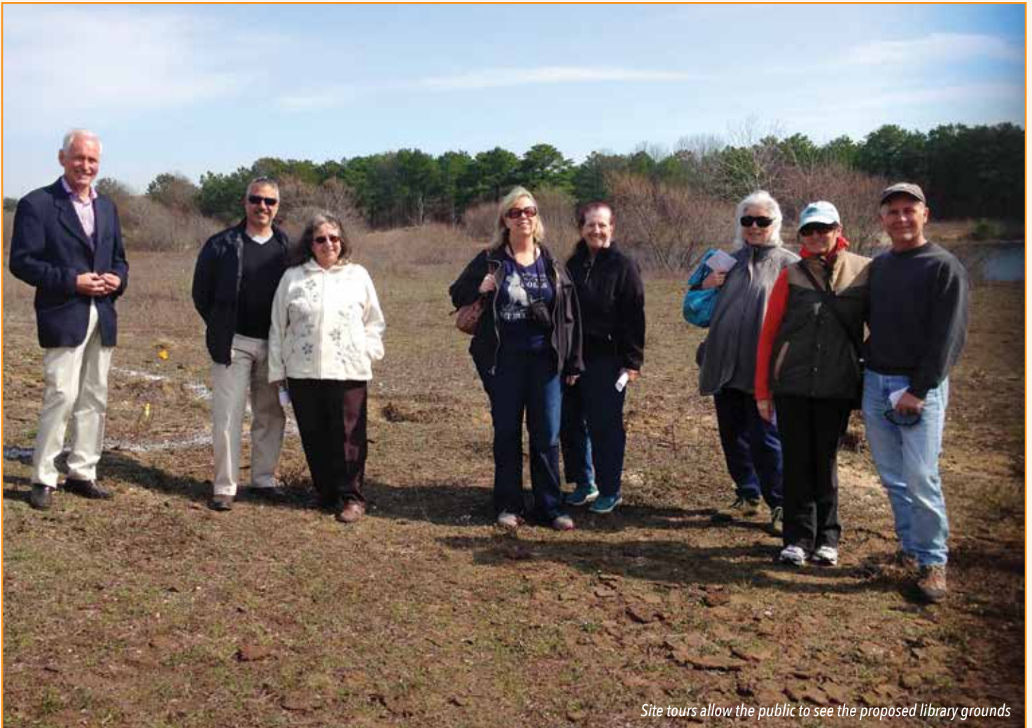
Site tours allow the public to see the proposed library grounds